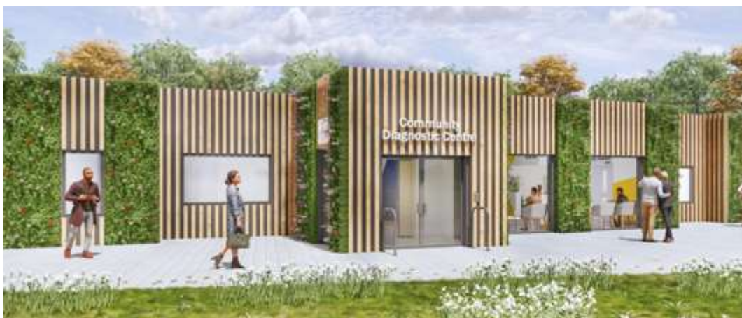
How the CDC might look

To find out more (including face to face meetings) and comment on the proposals please go to www.haveyoursayhinckley.co.uk ; follow the link on the Parish Council website; or telephone 0116-295-7572.