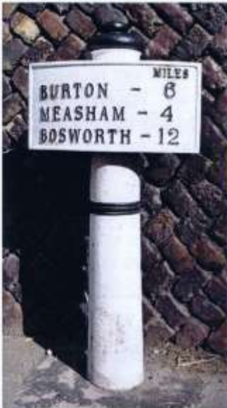
The recreated distance marker at Overseal